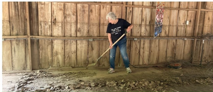
May Camp Egan Flood Work from TUMC People